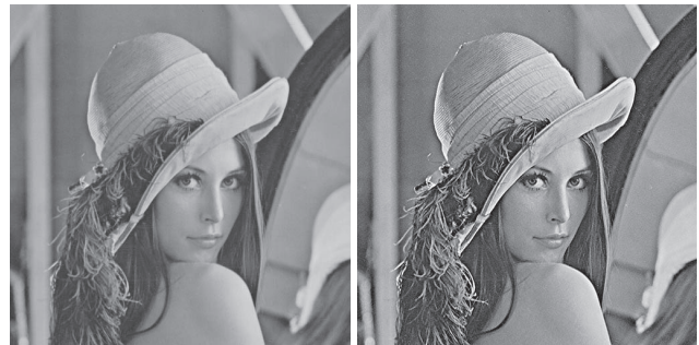
Fig. 2. Blind deconvolution of Lena image. Selecting the separable symmetric 21 \times 21 kernel k that maximizes the Sharpness Index of k \star u ( u being the original Lena image, bottom left) results in a sharper image (bottom right) that reveal some details of the original image, while keeping noise and ringing at an acceptable level.

perspectives, both from a theoretical viewpoint (the explicit formulas will probably ease further analyses) and as concerns applications (in particular image restoration), for which computation time and estimation errors are no more a limitation.