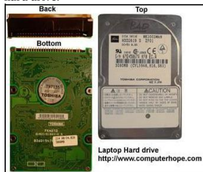
Figure 3: The disk controller circuit board on the bottom part of the hard drive.

As can be seen in the above Figure 6.1, the bottom of the drive has a circuit board, which contains the hard disk controller of the laptop hard drive.