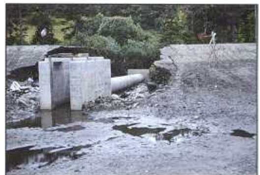
Failure of an earth dam by internal erosion along concrete outlet pipe.