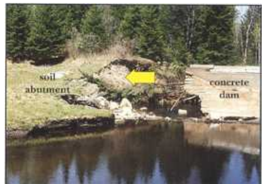
Failure at a concrete dam caused by internal erosion of the soil abutment (shown at arrow).