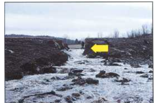
and later the dam failed!