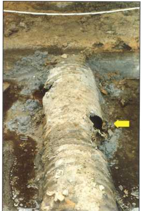
Corroded corrugated-metal outlet pipe removed from a dam that had developed large sinkhole.

Animal burrows on the upstream or downstream slopes of an embankment dam.