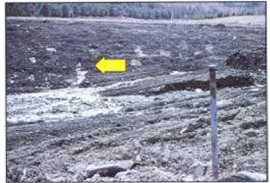
A spring discharging at the downstream toe of an embankment.