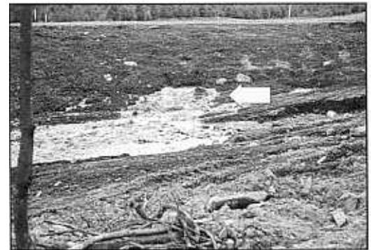
Within two hours, the spring became much larger . . .