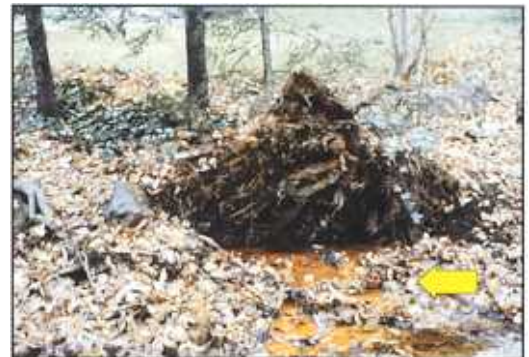
Spring (rust-colored water) that developed where the root ball of a tree pulled out of the ground near the downstream toe of a dam.