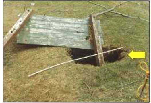
Sinkhole on the crest of an earth dam. The reservoir was lowered, and a 10-foot-diameter cavity was found under the sinkhole.

Sinkholes or subsidence anywhere on the embankment or an abutment. Water flowing into a sinkhole below the reservoir surface on the upstream slope of a dam is especially dangerous.