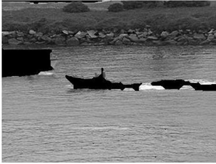
Figure 2. Segmentation of the 20th frame from the 'coastguard.cif' image sequence.