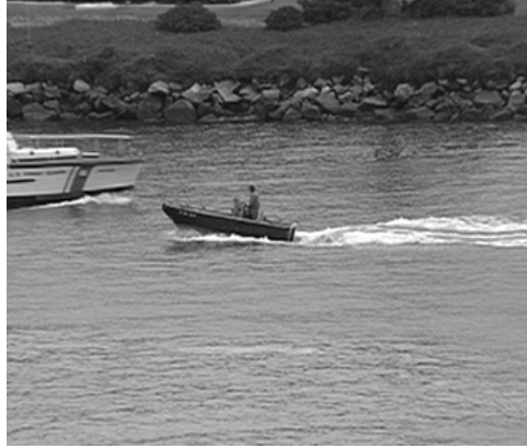
Figure 4. The first frame in the test ‘coastguard.cif’ image sequence.

it survives, meaning that the longer the feature is present during the feature updating mechanism process, the more stable the feature is. Therefore, the probability that this feature is a good feature to represent the object is high. We use an exponential function to calculate the weight for feature consistency: