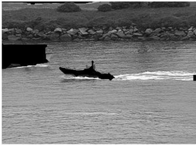
Figure 3. Segmentation result of the 20th frame after correction.