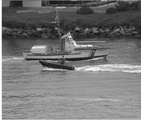
Figure 5. The last frame in the test image sequence.